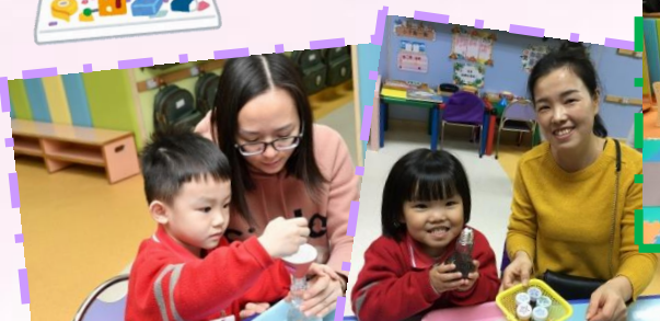
Positive parent-child seminar and mindfulness jar making activity