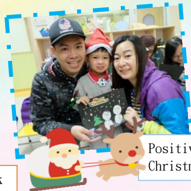
Positive parent-child workshop and Christmas Party