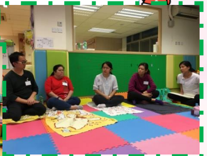
Mindfulness Course for parents