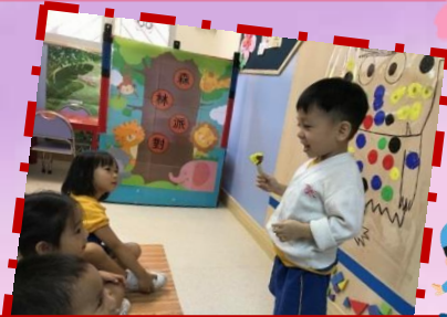
Daily sharing of feelings and experiences between classmates