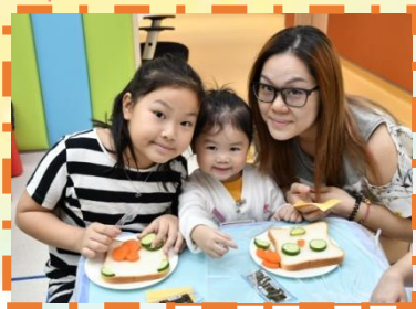
Parent-child snack making activity

Help our students and parents to appreciate themselves and others. Help them to develop a positive outlook on their lives through various activities