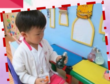
Use the mindfulness jar to relax

We value the all-round development of our students. Positive education helps us to develop the growth mindset among our teachers, parents and students. This allows our students to bring out their character strength, appreciate our effort and gain satisfaction and confidence. This also encourage our students to face their life challenges with positive attitude.