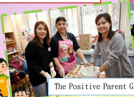
The Positive Parent Group had a cookie baking session